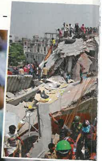
Chinese workers sew clothes to be sold in the U.S. Above: More than 1,000 people were killed when a factory building collapsed in Bangladesh.